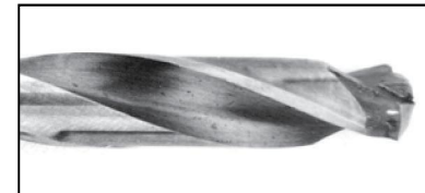
Improper Sharpening No Warranty