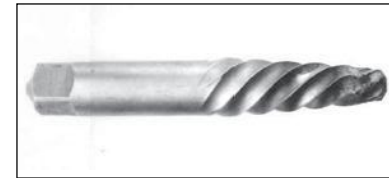
Flattened Point No Warranty